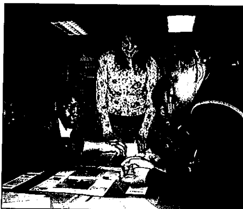
Student worked with elementary children with the Junior Achievements Program in Birmingham, Alabama.