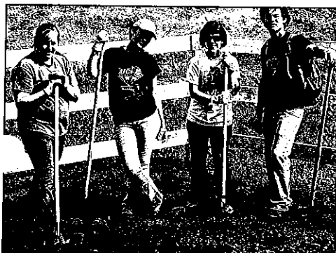
Students clean up in Brookside, Alabama.

Please submit your May 2009 UKnighted newsletter articles to jpardo@mail.ucf.edu by April 15.